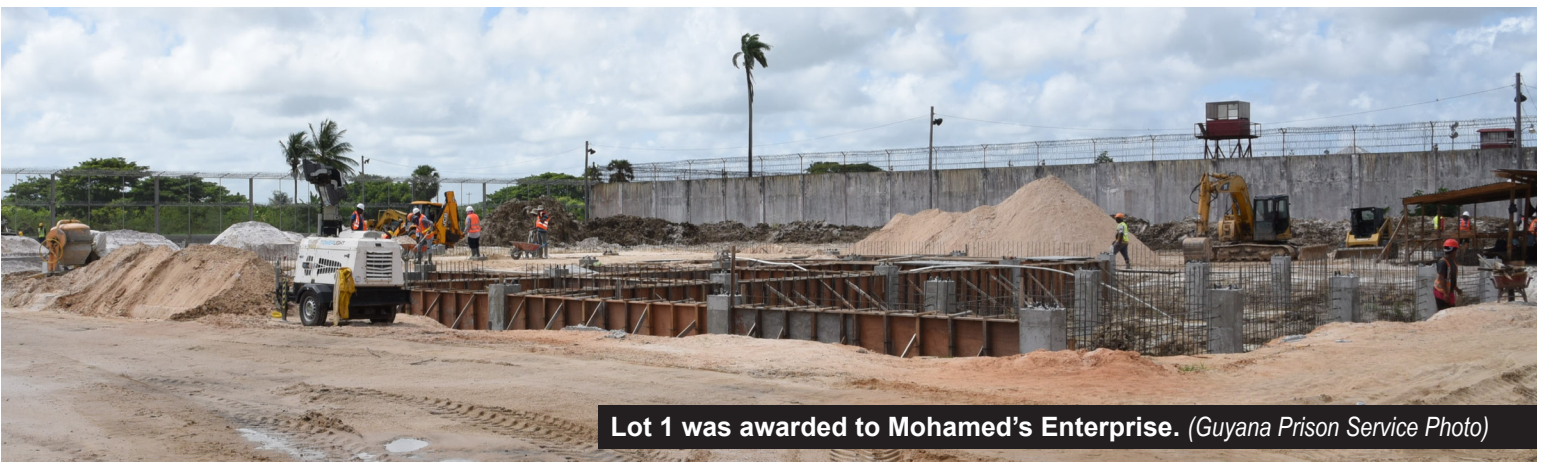
Lot 1 was awarded to Mohamed's Enterprise.

The completion of the three new blocks at the Lusignan Prison will accommodate 600 inmates.