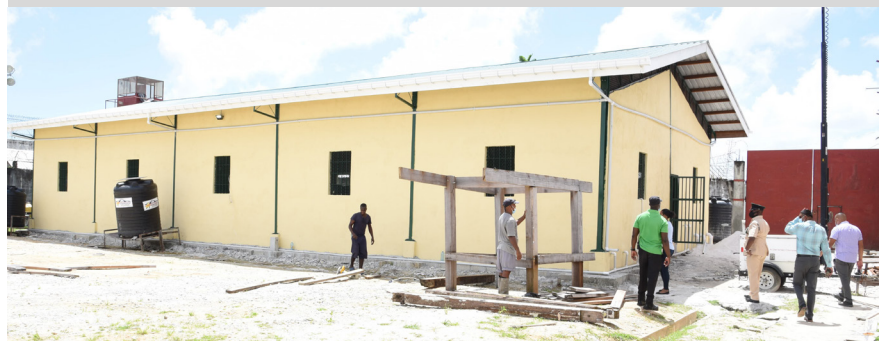
One of the two new Prison blocks at Lusignan Prison.

The construction of two new Prison blocks at the Lusignan Prison Estate have been completed