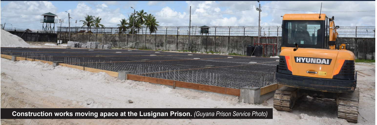
Construction works moving apace at the Lusignan Prison.