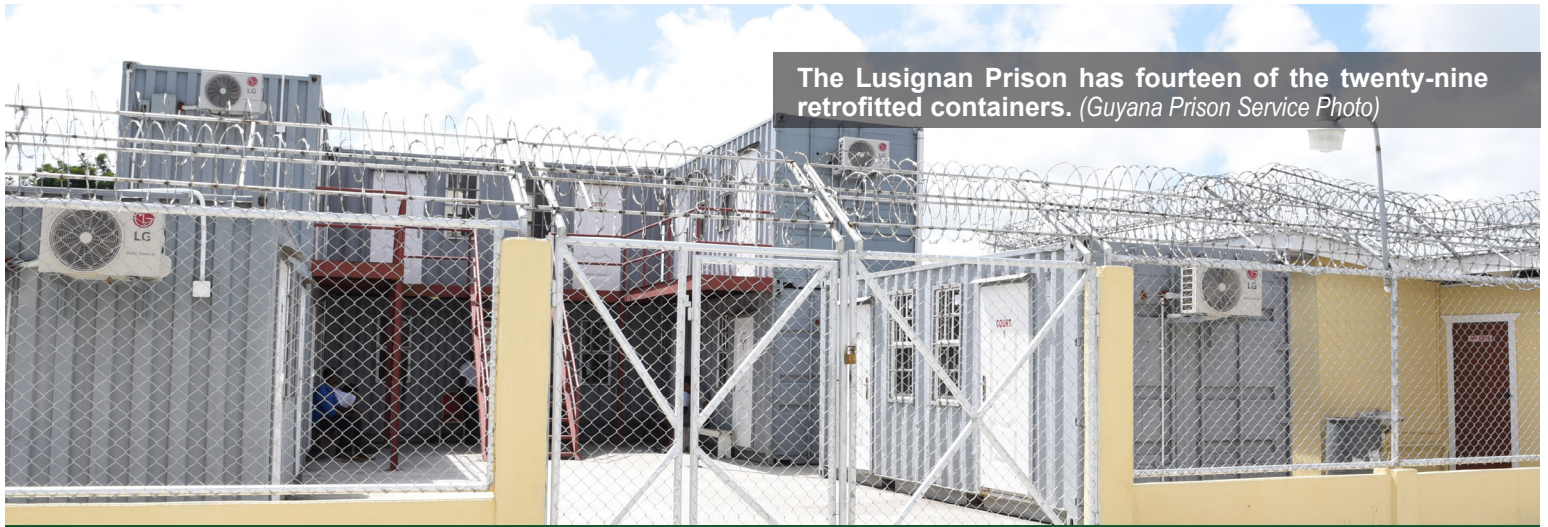
The Lusignan Prison has fourteen of the twenty-nine retrofitted containers.